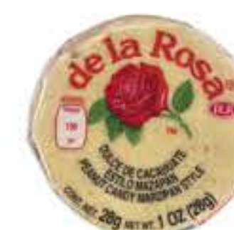
$3 pesos (each)