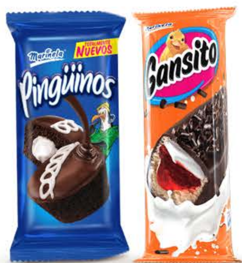
$15 pesos (each)