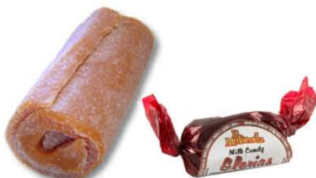
$10 pesos (each)