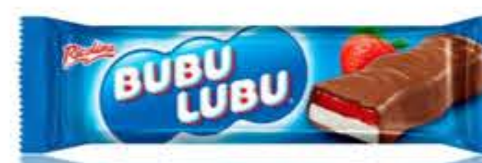
$7 pesos (each)